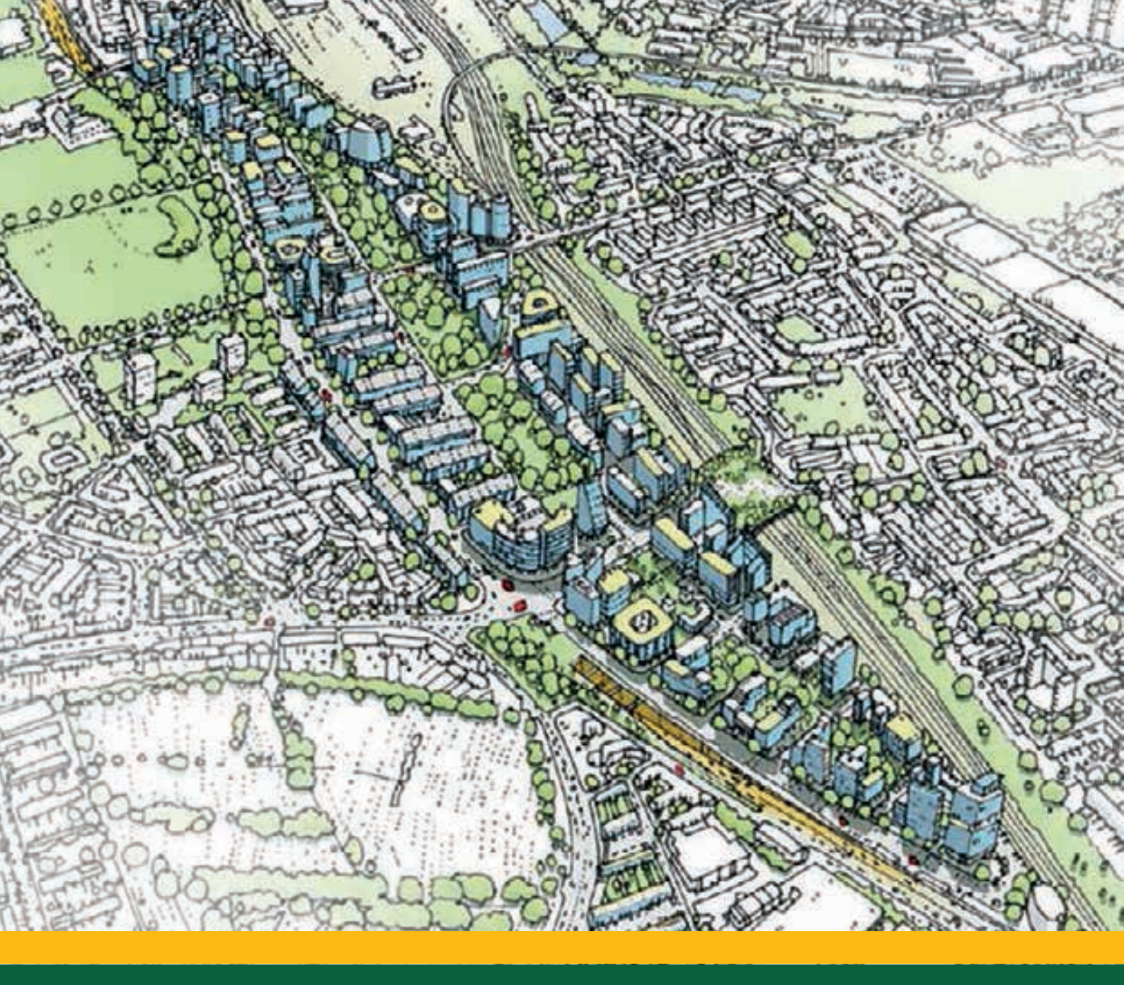
This image is for illustrative purposes only