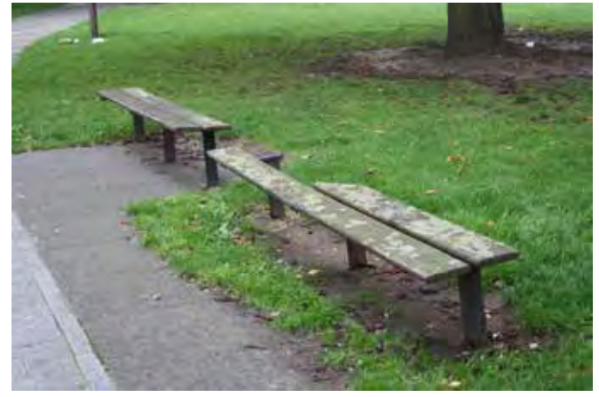
Dilapidated seating in Abbey Green.