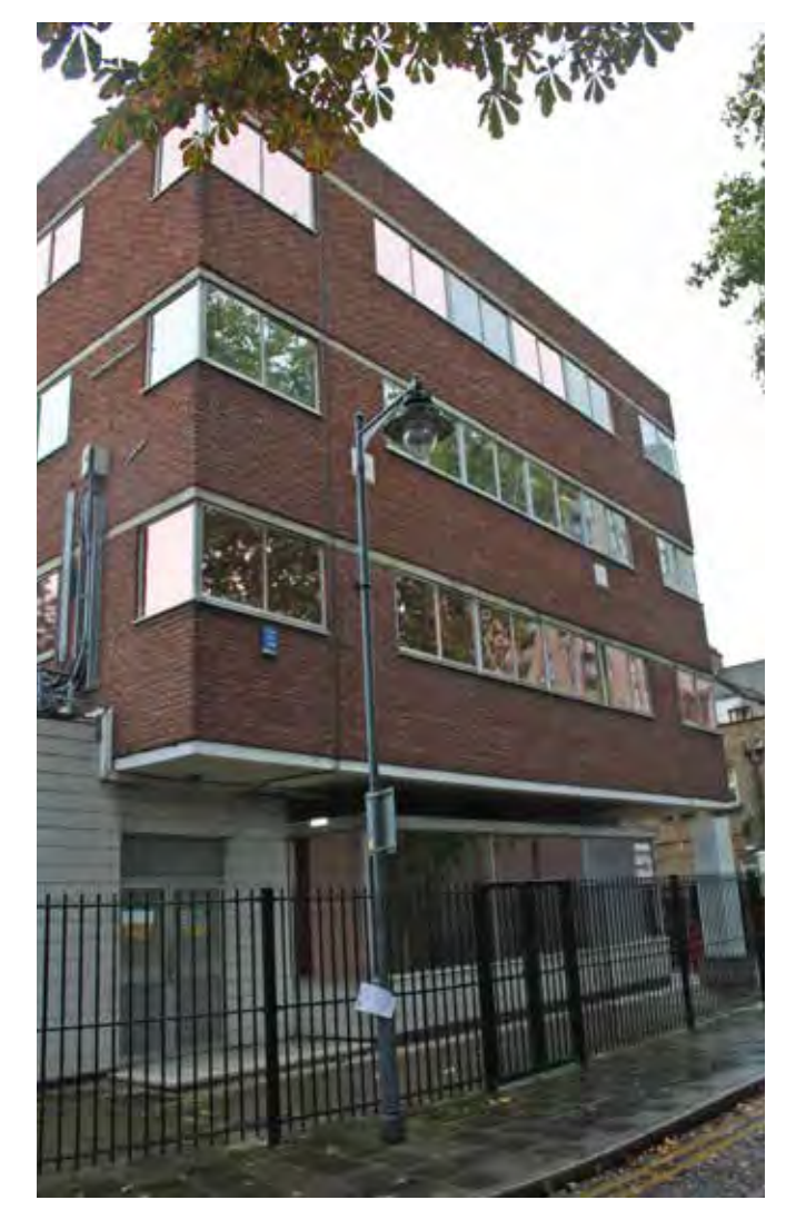
Glebe House on Vicarage Drive detracts from the conservation area due to its insensitive massing and appearance.