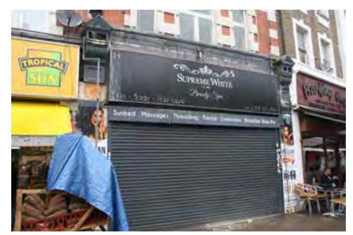
A shop in a dilapidated condition and with inappropriate fascia sign and metal roller shutter.