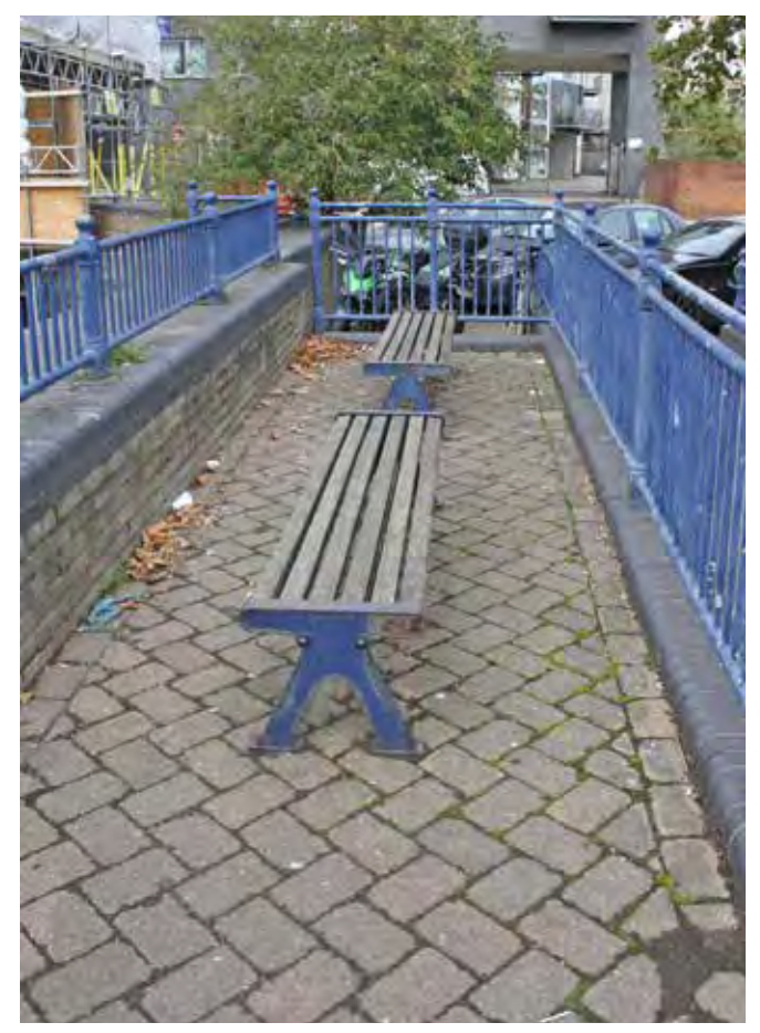
Outdated and neglected public realm around the Town Quay.