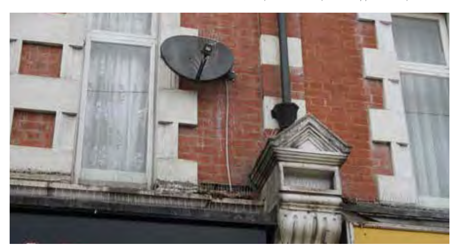
Pigeon spikes are used extensively in the conservation area, they detract from the conservation area and are also appear to be ineffective.