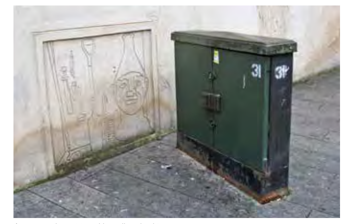
A very poorly positioned broadband cabinet.