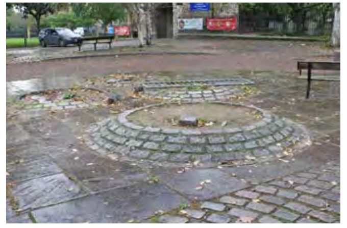
Damage to the granite setts in front of the Curfew Tower and loss of the feature trees.