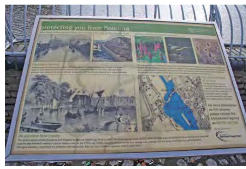
The different types of interpretation board within the conservation area.

It is recognised that there is already interpretative signage and information boards across the conservation area, which primarily provide information about the history and remains of Barking Abbey. There is currently a range of signage which is not consistent in appearance and some of which is dilapidated or has been vandalised. There are opportunities to improve dissemination of the town's history and special interest beyond its associations with the Abbey including the centuries old market and its highly successful fishing industry, as well as information about individual buildings such as the former Magistrates' Court. In addition to this, there is an opportunity to take a holistic approach to interpretative signage across the conservation area which would also be beneficial in terms of appearance but also assist in uniting the different sub-areas of the conservation area and generally raising awareness about the conservation area designation.