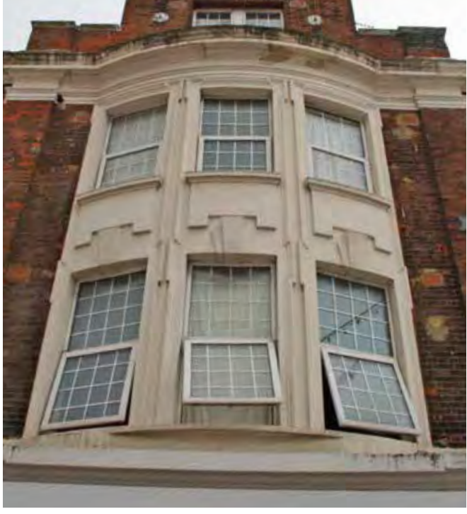
Insensitive replacement of traditional windows with uPVC units is harming the appearance of the conservation area.