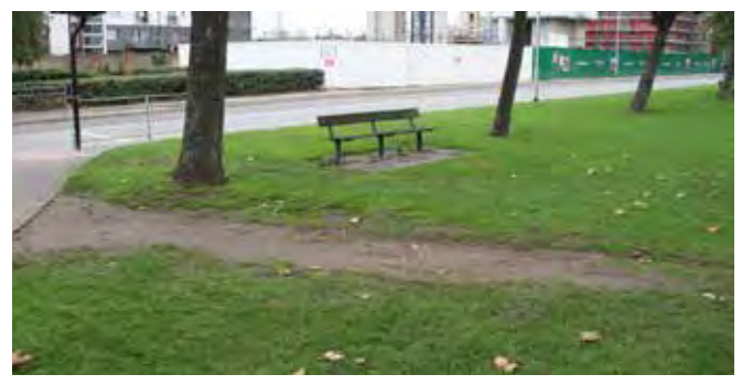
Erosion to the grass at the edge of the park, the footpaths should be reviewed to ensure their alignment is correct.

The final issue related to the public realm is the inappropriate positioning of broadband cabinets. Units have frequently been placed indiscriminately within the street often hindering pedestrian movement as well as being visually intrusive. Broadband cabinets are an alien, modern feature and detract from the appearance of the conservation area. There are opportunities to consider the relocation of existing cabinets to more discrete locations and whether such features are appropriate for installing in the conservation area in the future.