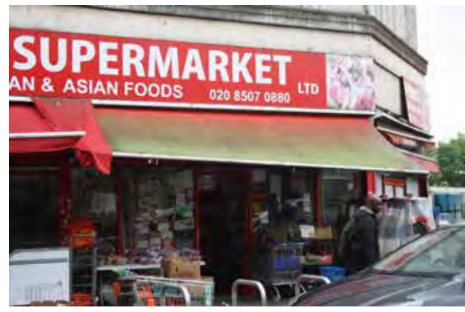
The inappropriate signage and canopy above modern metal shop frontage detracts from the appearance of the building and the conservation area more widely.

The scale, material and internally lit nature of this shop signage, both projecting and fascia, is inappropriate within the conservation area. Dutch-style canopy is in inappropriate as it remains visible when retracted. The canopy is poorly positioned below the signage and is dilapidated. This shop front also has a roller shutter which also detracts.