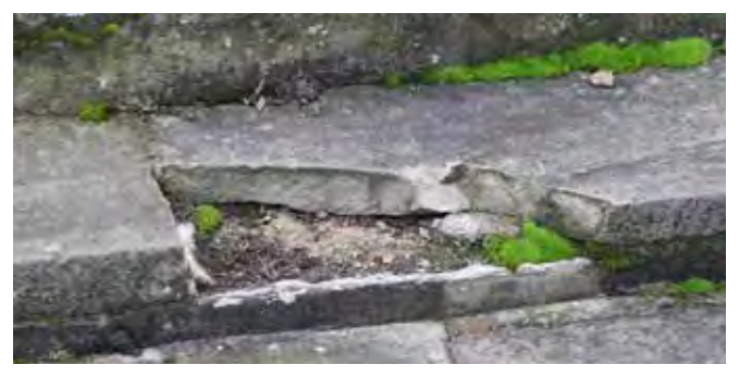
Damage to steps in the Abbey remains; the steps are made from former gravestones