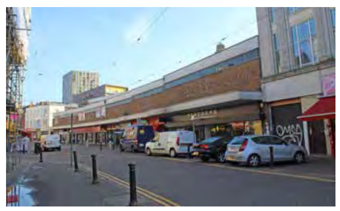
East Street detracts from the conservation area primarily due to the building's horizontal appearance and lack of an active frontage on the upper floors.

As identified in section 5.0, there are a number of buildings in the conservation area which detract from its special interest. These are frequently post-war period buildings which are insensitive in terms of their scale, massing or materiality or detailing to the historic character of the conservation area. These include for example 10-30 East Street and Glebe House on Vicarage Drive. The inclusion of these buildings in the conservation area, whether or not they are fit for purpose, dilutes its special interest. Detracting buildings therefore offer great potential for enhancement of the conservation area either through refurbishment but more likely through their replacement with sensitivelydesigned buildings which respond better to the character and appearance of the conservation area.