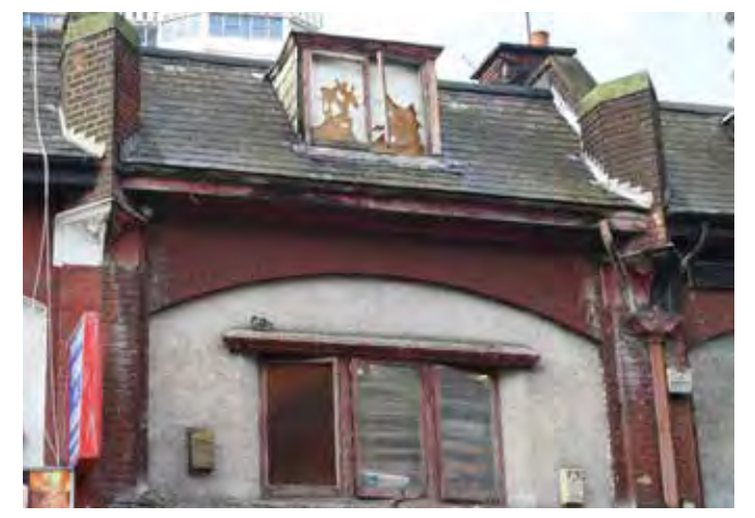
This building is in an extremely dilapidated condition due to lack of maintenance.