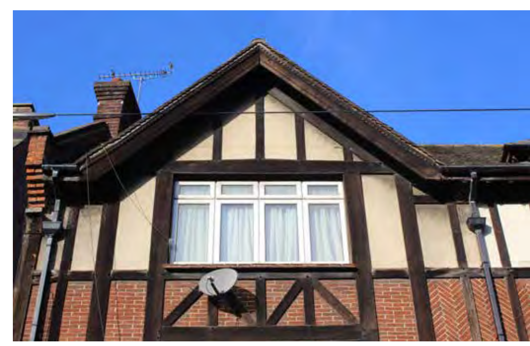
Insensitive replacement of traditional windows with uPVC units is harming the appearance of the conservation area.