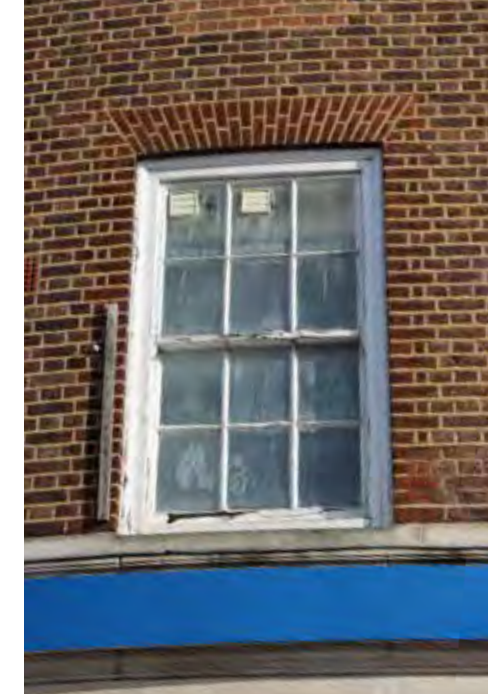
Many of the surviving timber windows are in a poor condition from neglect and lack of maintenance