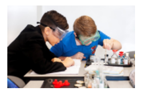
Pupils are well prepared for life in modern Britain by their tutorial lessons, which help them to understand democracy, religion tolerance and the importance of the rule of law.

The school develops the spiritual, moral, social and cultural education of pupils exceptionally well through the curriculum, a range of assemblies and other enrichment activities. The school has recently launched its new vision and values Believe, Grow, Succeed. Pupils and staff of all faiths and backgrounds take part in a wide range of Christian worship each day.