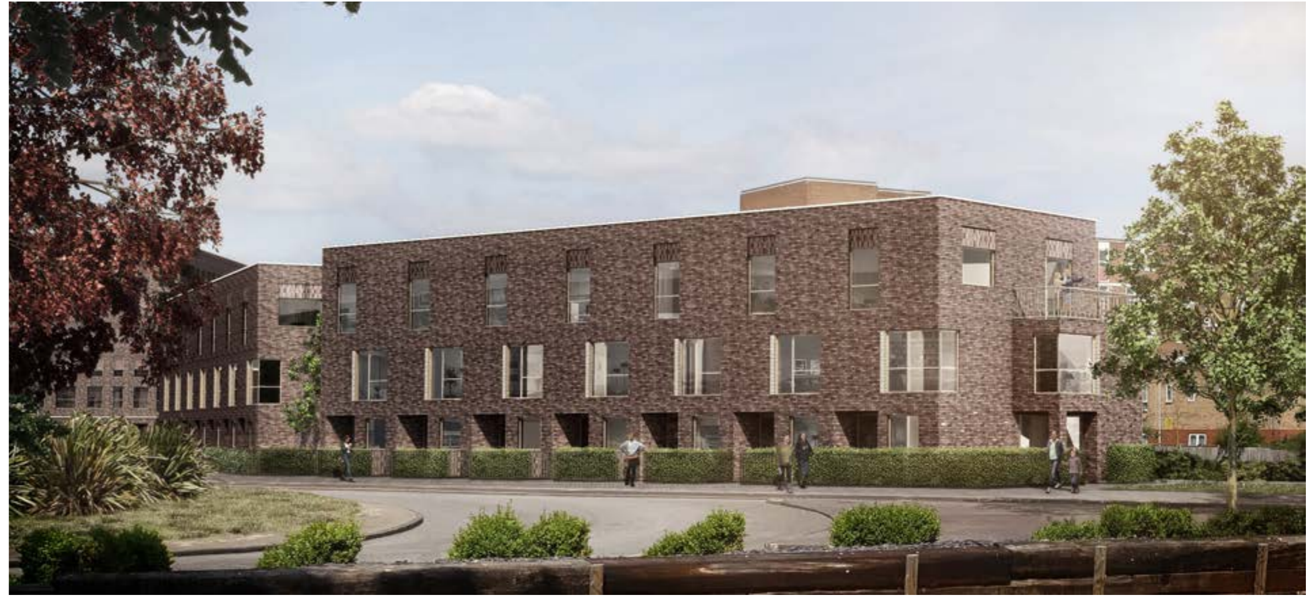
Bid Scheme design intent: terraced houses along Wood Lane by the Civic Centre roundabout