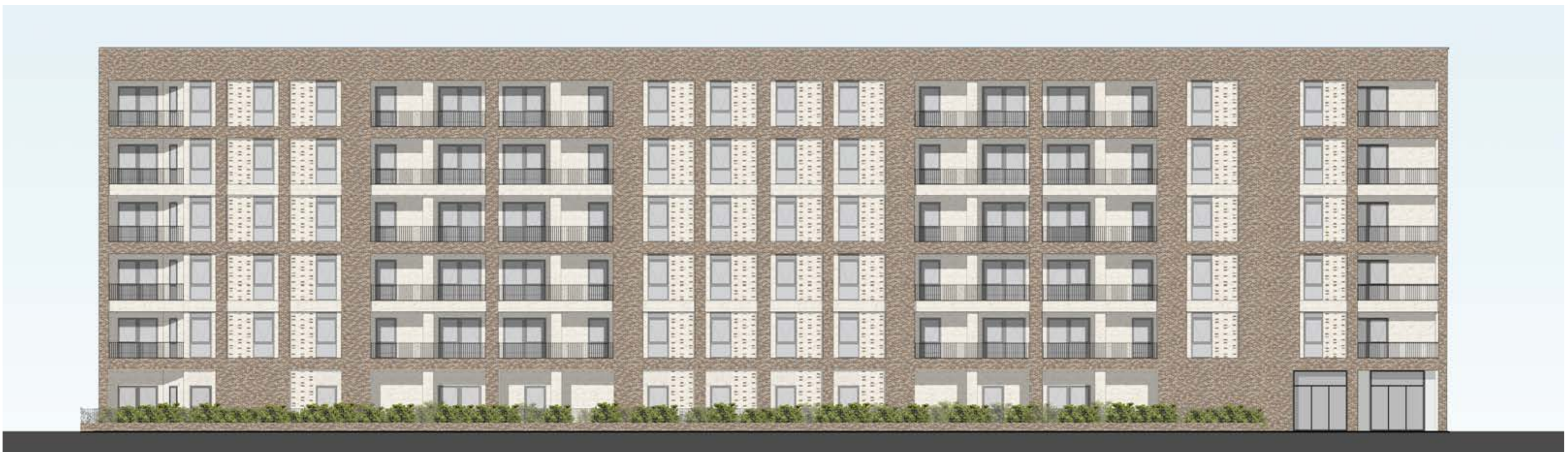
Example elevation of the apartment blocks

Dagenham Civic Centre is a strong local landmark and a character cue for the architecture of the new residential development.