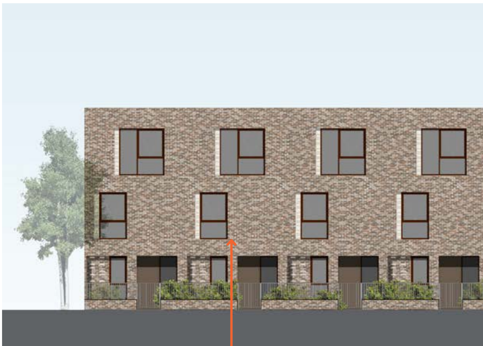
Front elevation of the town houses