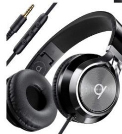
ARTIX CL750 BLACK