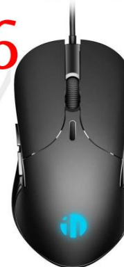
Optical Mouse DPI: 1200 - 4800

DPI Adjusting Button: 5 Buttons and Scroll Wheel