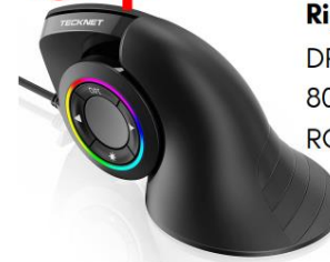
Right-Handed Vertical Mouse

DPI Adjusting Button - 6 Levels: 800/1600/2400/3200/4800/8000 RGB Lights with 7 Buttons