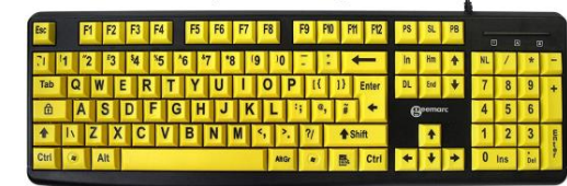
Yellow Large Print Computer Keyboard, High Contrast Yellow Keys with Big Print Letters