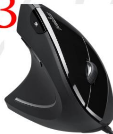
Left-Handed Vertical Mouse 1000/1600 DPI

DPI Adjusting Button Next/Previous Buttons 5 Buttons and Scroll Wheel