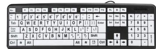
Press Esc to exit full screen White Large Print Computer Keyboard, High Contrast White Keys with Big Print Letters