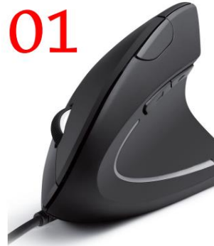
Right-Handed Vertical Mouse 1000/1600 DPI

DPI Adjusting Button Next/Previous Buttons 5 Buttons and Scroll Wheel